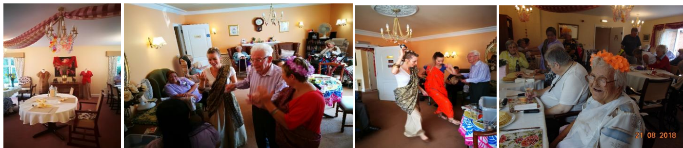
India themed day was much enjoyed by all, with beautiful themed decorations, costume, dancing and a special menu.